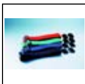
Velcro Belt Set