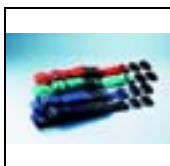
Quick-Release Belt Set