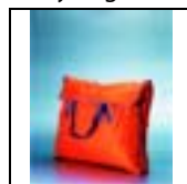
Mattress Carry Bag