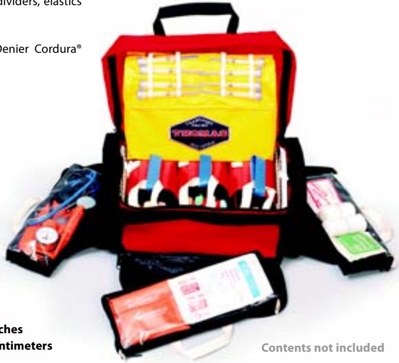
Thomas Medical Support Pack MB660003 TT600, Red

Dimensions (L,W,H): 12 x 14 x 7 Dimensions (L,W,H): 30 x 37 x 21