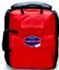
Thomas ALS Pack MB610003 Orange with Black trim

Dimensions (L,W,H): 12 x 14 x 7 Dimensions (L,W,H): 30 x 37 x 21